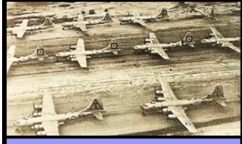
B-29s of the 58 BW, West Field, Tinian (Top) & 314 BW, North Field (AAFB), Guam, staged & loaded for the POW Supply Missions from Isley Field, Saipan.

27 Sep 1945-28 Feb 1946 — SUNSET PROJECT , with the war over with Japan, it was time to return the crews and B-29s from the 8th/20th Air Forces, and B-24's from the Far East Air Force. The flights were flown by combat crews operating under Air Transport Command (ATC) control and carried passengers assigned as extra crew members, all Airmen required to be eligible for separation. The returning bombers passed through the Marianas, Kwajalein, Johnston Island, and John Rodgers Field (Oahu) to Mather Field, CA. The