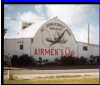
Rare color photo of the 19 BW Airmen's Club in 1952. (Bruce Young)