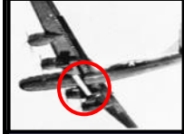
315BW B-29B inflight shows the AQN-7 "Eagle" radar antenna underneath the wings.

1 Aug 1945 — Largest WWII Bombing Attack in the Pacific , when 836 B-29s from all Marianas based bomb wings attacked several locations in Japan.