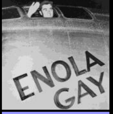
Col Tibbets waves from the cockpit of the B-29 "Enola Gay" while taxiing on North Field, Tinian, just before takeoff on the Atomic Bomb "Little Boy" Hiroshima mission.

2 Sep 1945 — Surrender Photos to CONUS . An eligible mixed crew and a B-29 from the 330 BG, 314 BW, North Field (AAFB), Guam, flew the surrender photos from Iwo Jima to Wright-Patterson AFB, OH. Then a train took the photos the rest of the way to D.C. *Note: Another B-29 from North Field, Tinian, may have taken the actual documents to the CONUS too.