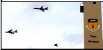
17 Aug 2016 — All three of AFGSC's strategic bombers simultaneously conducted operations in the U.S. PACOM area of operations for the first time in history.