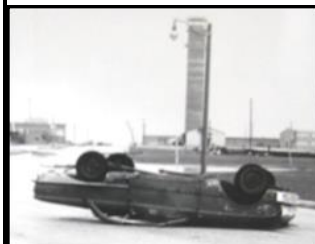
Super Typhoon Pamela's destructive nature can be seen in this photo. In the background, all the windows, except one, were blown out of the tower.

c. Jan 1976 — Military Housing in Andersen South started to be built.