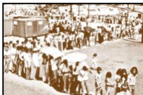
Vietnamese refugees in a line at "Tin City" AAFB, Guam., 1975.

18-29 Dec 1972 — Operation LINEBACKER II . When North Vietnam showed unwillingness to negotiate the end of the war, the Pres. Nixon unleashed the B-52s out of AAFB and U-Tapao. During this "11-Day War" there were over 153 B-52s on the ramp supported by an estimated 15,000 Airmen (a third of whom were maintainers). 15 B-52s lost, 8 from AAFB. The Paris Peace Accords were signed on 27 January 1973.