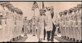
21 Mar 1967 — Super DV Day . President Johnson, South Vietnam President Nguyen Van Thieu, & PM Nguyen Cao Ky; plus, all of the President's Cabinet visited AAFB. President awarded 12 B-52F Crewdgs with medals & spoke in front of the current 36 WG HQ. in the rain. It was also the first time Andersen Radio broadcasted a live event to AFRT & around the world.

10 Apr 1967 — Operation POKER DICE . SAC sent three B-52Ds from AAFB to U-Tapao AB, Thailand, officially opening the base for B-52 combat operations. An important BUFF base during the Vietnam War, as it shortens the distances to target, with no in-flight refuelings, compared to the grueling 2,600 mile sorties from Guam.