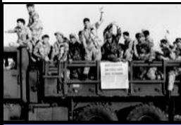
Airmen deployed from AAFB return to a Heroes' Welcome after Operation DESERT SHIELD & STORM in 1991.

28 Feb 1986 — Former Philippine President Ferdinand Marcos was exiled to the U.S. His first stop was AAFB, Guam.