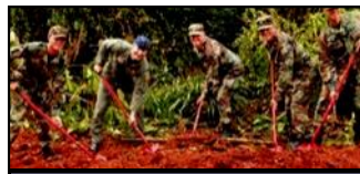
11 Oct 2006 , PRTC Groundbreaking.