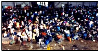
12 Jun 1991 — Operation FIERY VIGIL . The volcano Mt. Pinatubo, RP., erupted in close proximity to Clark AB. In the wake of the eruption, then a typhoon; more than 21,000 U.S. Military, family members, and pets evacuated from the Philippines. Eventually, all the evacuees made it to AAFB, Guam, for processing to CONUS. Photo: FIERY VIGIL evacuees being processed in one of the old hangars at Andersen.

8 Aug 1993 — 8.1 Earthquake! Known as the "8.1", the USGS later reduced it to an 7.8 magnitude. There were four aftershocks over 5 magnitude. It caused various damages across Guam. On AAFB the damages included: 1) Tower swayed 8-10 feet and a fire broke out on the 15th floor; 2) Current 36 MXS Bldg.18006 had to be abandoned until major repairs were completed; 3) Over 90,000 bombs fell off their racks; 4) Loss of power and water; and 5) two injuries. In spite of the damage, AAFB was declared ready for air ops within 14 hours after the quake.