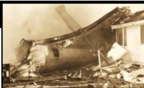
B-29 tail leaning against on a house after the 17 Dec 1953 Crash.