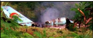
Wreckage of KAL-801 smolders in the morning of 6 Aug 1997, after crashing on the Nimitz Hill.

21-23 May 2001 — Joint CAPEX . AAFB hosted PACAF sponsored Combat Ammunition Production Exercise (CAPEX) for the first time. It was also the first Joint Services CAPEX. 300 service members from three different branches of the military participated.