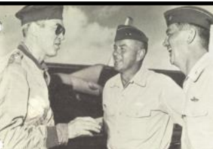
21 Feb 1966 , Brig Gen Jimmy Stewart, USAFR, famous Actor (Left) flew an ARC LIGHT mission from AAFB during Vietnam on a B-52F. Gen Crumm is in the center of the photo.

Andersen AFB's operations evolved significantly with the arrival of the first B-52Bs in 1964. On 12 Feb 1965, 30 more B-52Fs arrived as the U.S. involvement in Southeast Asia escalated. Soon the eight-year campaign called Operation ARC LIGHT would begin. It was during this time that Andersen AFB, Guam, became synonymous with the B-52.