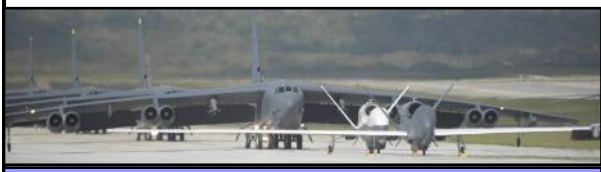
13 Apr 2020 — Elephant Walk . USN MH-60S Knighthawk , USAF RQ-4 Global Hawk , USN MQ-4C Triton , B-52H Stratofortresses , & KC-135 Stratotankers assigned to Guam performed an "Elephant Walk". During COVID-19, it showed Team Andersen's ability to generate combat airpower at a moment's notice to ensure regional stability throughout the Indo-Pacific.