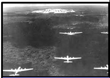
Formation of B-29 Superfortresses from the 19 BG, 314 BW, XXI BC, 20 AF, prepare to land at North Field (AAFB), Guam, during WWII.