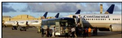
19 Aug 2005 — “ Andersen International Airport ” A Northwest Airlines 747 nose gear collapsed while landing, blocking the runway at Guam's International Airport. The 36 MXS assisted with emergency removal of the aircraft and Team Andersen landed nine civilian airliners at the base.

29 Apr 2005 — Theater Security Package (TSP) . AAFB hosted 12 F-15E Eagles of the 391st Expeditionary Fighter Squadron (391 EFS). This was the first TSP fighter unit deployed to Guam.