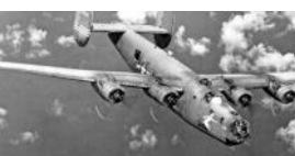
Guam assigned 98 BS, 11 BG, B-24J Liberator, S/N 42-109951, nose art, “Madam Pele.” Japanese -American high school students in Oahu, HI, raised & donated $350k to have this B-24 built.