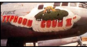
Nose art “Typhoon Goon II” 54 SRS (W), WB-29 S/N 44-69970.

6 Oct 1952 — Weather Aircraft Lost . 54 SRS (W), WB-29 S/N 44-69970, nose art “Typhoon Goon II” and its crew were lost while penetrating the eye of Typhoon WILMA, 300 NM east of Leyte, Philippines. First loss of any USAF Weather Service aircraft while actively engaged with any type of cyclone.