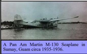
A Pan Am Martin M-130 Seaplane in Sumay, Guam circa 1935-1936.

22 Nov 1935 — Amid much fanfare, the first Pan Am Martin M-130 flying boat China Clipper launched from the waters of Alameda, CA with 1,837 pounds of mail; officially opened the Trans-Pacific route. This inaugural Trans-Pacific Airmail Flight passed through Guam, 27-28 Nov 1935.