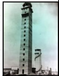
Control Towers, Early 1970s