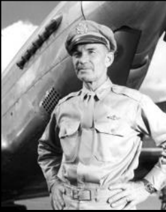
Lt Gen Millard F. Harmon, Commander Army Air Forces Pacific Ocean Area (USAAFPOA/CC).