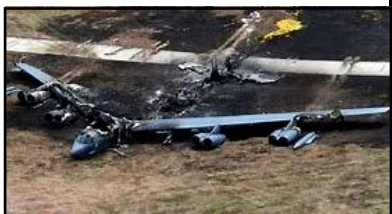
19 May 2016 — 69 EBS, B-52H, S/N 60-0047. Nose art "Neanderthaul" had a take off accident at AAFB. All seven crewdogs egressed safely.

Elephant Walk. USN MH-60S Knighthawk , USAF RQ-4 Global Hawk , USN MQ-4C Triton , B-52H Stratofortresses , & KC-135 Stratotankers assigned to Guam performed an "Elephant Walk". During COVID-19, it showed Team Andersen's ability to generate combat airpower at a moment's notice to ensure regional stability throughout the Indo-Pacific.