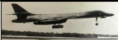
14 May 1988 — First Lancer . B-1B Lancer, S/N 85-0072, nose art "Polarized" landing at AAFB.

12 Oct 1983 — The Last Tall Tail . The last B-52D, known for their Vietnam Era black and camouflage paint scheme, departed AAFB. During Operation LINEBACKER II, the same B-52 S/N 56-0676, was the first B-52 to shoot down an enemy aircraft. It is currently on static display at Fairchild AFB, WA.