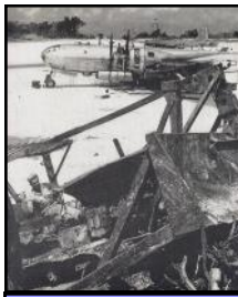
B-29s & bulldozer at North Field, Guam 1945.

25 Feb 1945 — Commander Army Air Forces Pacific Ocean Area (Basically,