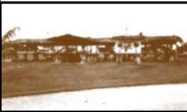
Sister Village huts, 1977