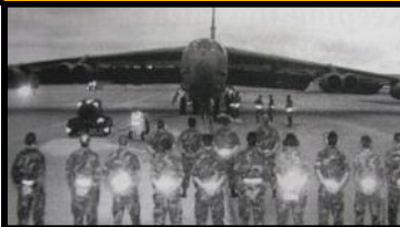
B-52H's First Combat Mission? DESERT STRIKE, 1 of the 2 BUFFs shown here returning to AAFB, Guam, 3 Sep 1996.

On 1 Oct 1994, the 36th Air Base Wing (36 ABW) activated at Andersen AFB; the 633 ABW was inactivated. Prior to Guam, the 36th was a Fighter Wing (36 FW) at Bitburg AB, Germany. Other units also moved from USAFE and activated on Guam that day were the: 36 LG (now MXG), 36 MDG, 36 SPTG (now MSG), 36 CES, 36 CONS, 36 CS, 36 MDOS, 36 MDSS, 36 MSS (now FSS), 36 MXS, 36 OSS, 36 SFS, 36 SPTS (now LRS), & 36 CPTF (now CPTS).