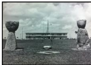
Latte Stone Point, 1960