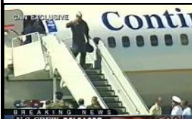
11 Apr 2001 — VALIANT RETURN at AAFB, Guam. (CNN)