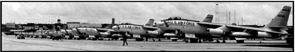
15 B-47s lined up on the South Ramp, AAFB, circa 1956.

during a WWII combat mission from Australia, 14-15 Nov 1943. The outdoor Turner Memorial Theater would close.