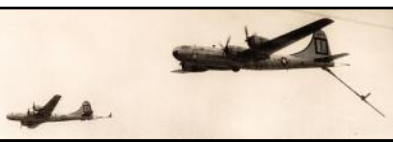
Two KB-29Ps of the 91st Air Refueling Squadron (91 ARS) during Operation FOX PETER ONE.

6 Aug 1950 — The First Rotational Bomber Deployment . Strategic Air Command’s (SAC) began deploying B-29 and B-50D Superfortress to AAFB. The base wing supplied security forces and administrative support to the forward-based units.