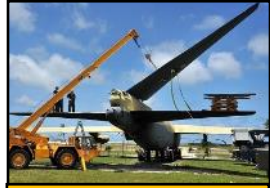
ARC LIGHT Memorial B-52D 56-0586 painted as “Old 100” was scrapped in Apr 2014.