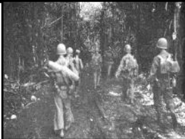
Marines moving up Salisbury-Tarague Trail during the last week's of engagements on Guam, Aug 1945.

8-10 Aug 1944 — The Last Tank Battle on Guam took place on Andersen AFB property. The location was on the pre-war Salisbury-Tarague Trail, near today's 36 MUNS's Storage Area One (MSA-1), the road that leads down Tarague Beach. Several USMC M4 Sherman tanks battled seven Japanese medium tanks in a short exchange of fire. The crews abandoned the tanks and retreated over the cliff line.