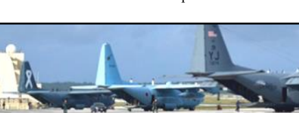
First International Operation CHRISTMAS DROP 2015 (See 10 Dec 2019)

15 Aug 2016 — B-1B Returned CBP . The BONES of the 34 EBS returned in support of PACOM’s Continuous Bomber Presence (CBP) mission. It was the first time B-1Bs were part of CBP rotation since 23 Apr 2006.