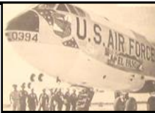
The first deployed B-52B to land was the "City of El Paso" S/N 53-0394.

15 Jun 1964 — The 1507th Support Squadron and the MATS terminal moved from NAS Agana to AAFB.