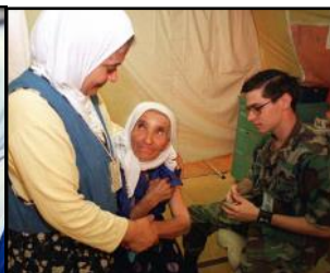
16 Sep 1996-30 Apr 1997 — Operation PACIFIC HAVEN . Team Andersen supported 6,572 Kurdish refugees for 6-months after DESERT STRIKE. 64 Kurdish babies were born on Guam too!