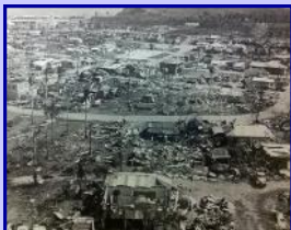
Super-Typhoon KAREN's total destruction of Guam's villages prompted the construction of buildings in concrete.

Following the KAREN Rebuild, apart from upgrades and beautification projects, AAFB saw very little new construction until after the 9/11 Attacks in 2001.