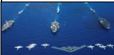
19-24 June 2006 — First Exercise VALIANT SHIELD, formations of multi-service combat aircraft & three USN Carrier Strike groups, of the USS Kitty Hawk, USS Ronald Reagan and USS Abraham Lincoln, led by a B-2 Spirit of the 393 EBS. VALIANT SHIELD was an exercise that focused on integration of joint training among US forces.