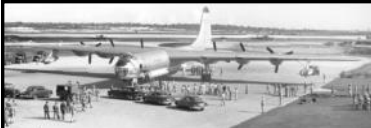
First B-36J Peacemaker arrived at AAFB, 1 Oct 1954. It carried the 92 BW's ADVON team. The rest of the Wing arrive 16 Oct 1954.

1 Apr 1955 — SAC took over the base completely when the 3 AD assumed area control and the 6319th Air Base Wing inactivated. The 3960 ABW activated. The Cold War had arrived to the Marianas to stay.