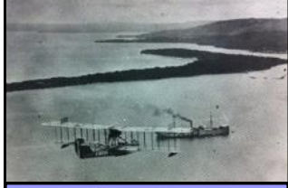
PFC Art Price, USMC, photographed this flight over Apra Harbor, Guam in 1923.

13 Oct 1935 — A Pan Am flying boat, Hong Kong Clipper , Sikorsky S-42, on its first Trans-Pacific Survey Flight landed on Apra Harbor, Guam, and taxied into the newly completed flying boat base at the seaside village of Sumay.