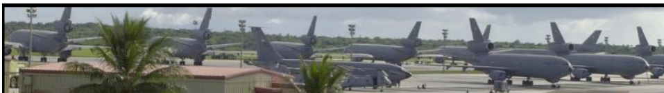
Rows of KC-135s and KC-10s on the North Ramp during Operation ENDURING FREEDOM .

and tanker combat operations of the 40th Air Expeditionary Wing (40 AEW).