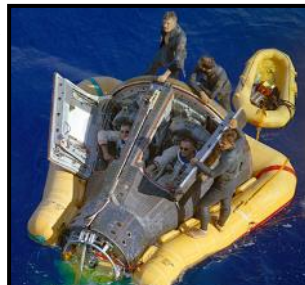
16 Mar 1966 — GEMINI 8 RESCUE . NASA mission went awry & landed 430 miles east of Okinawa, instead of the Atlantic Ocean. AAFB's own 79 ARRS, was assigned secondary recovery force at Naha, Okinawa. Luckily, the rescue pilot saw the capsules parachute on the first pass and 3 Pararescuemen (PJs) jumped from the aircraft & stood by the capsule until a USN destroyer arrived.

7 Jul 1967 — Crumm Tragedy . Maj Gen William J Crumm, 3 AD, commander, AAFB, was lost on his fini-flight when the B-52D call sign RED 1 collided with another B-52D call sign RED 2. Both bombers crashed about 20 miles off the Vietnam coast. Gen Crumm is the highest ranking US military officer missing in action from the Vietnam War, presumed dead.