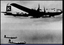
B-29 "Colleen" flies in a 330 BG formation. Colleen was named for the pilot's one year old daughter. She visited the crash site in 2002.

Field, Guam. Although, it was less than two months before the end of WWII, the wing would complete 15 important combat missions on Japan's oil facilities at night.