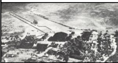
Pan Am Facilities, Sumay, Guam, 1935-41.

8 Dec 1941 — The Pan Am Philippine Clipper heard that Guam had been attacked. It was on a routine flight from Wake Island to Guam carrying a Flying Tiger pilot and cargo full of airplane tires bound for China. The Clipper returned to Wake Island where it sustained 60 bullet holes from Japanese strafing attacks. Then loaded with as many people possible and returned safely to Hawaii. The start of WWII ended Pan Am's Trans-Pacific routes. All Clippers were transferred to the US Navy.