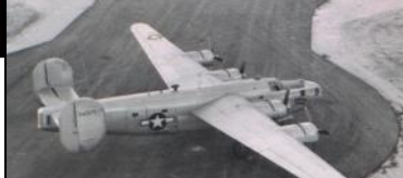
314 BW's Administrative C-87 (B-24) Liberator Express , nose art "Maximum Goose" was the first aircraft to ever land at North Field (AAFB) on 3 Feb 45.

26 Jun 1945 — First Combat Mission of the 315 BW , Northwest