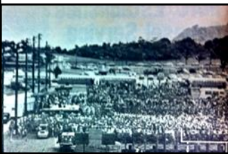
Crowd of 17,000 to see Bob Hope's USO Show at Gilkeson Field, AAFB, 1970

one time had bleachers where Airmen watched the Andersen Bombers football team play. The field was also used for Bob Hope's USO visits in the 1957 to 1972.