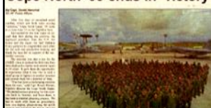
21 June 1999 — First Cope North Guam . Exercise COPE NORTH '99 was the first time the Japan Air Self-Defense Force (JASDF) deployed outside of Japan since WWII.